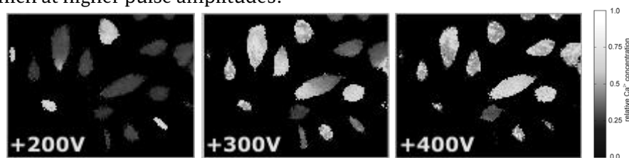
Figure 2: Cells stained with Fura-2AM and exposed to electric pulse with increasing amplitude.